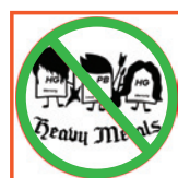
Free of Heavy Metals