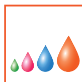
Piezo Variable Drop